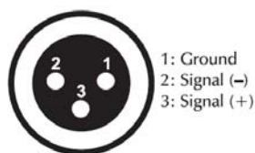
DMX-output XLR mounting-socket: