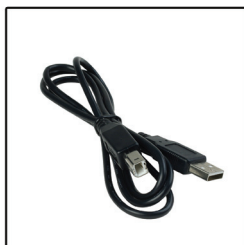
6' USB CABLE